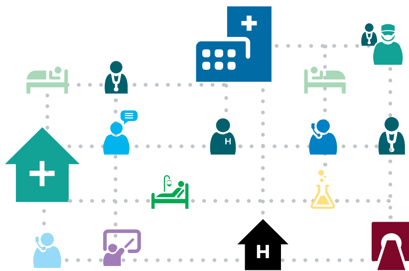
Large modern health systems are made up of multiple departments, a diverse range of people forming internal and external teams and differing objectives

Amgad Moawad, Solutions Delivery Manager, Philips Canada explains in more detail: “In a contract, especially of complexity magnitude that we engage in with partners such as Mackenzie Health, governance is actually one of the glue factors in maintaining the relationship and ensuring that both parties get the best value out of these relationships. With the governance committee, you bring together the different areas of the hospital who were not involved in the actual creation and signing of the contract, and start to try to align on interpretation by working in tandem. The governance portion consists of several different layers that allow for multiple checkpoints on both sides and ensures equal participation in the relationship by both Philips and our hospital partner. Governance makes it possible to set and achieve objectives to drive improvements but most importantly embed the ethical standing between the two organizations.”